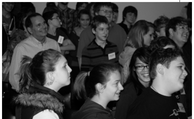
Students and advisors listen to the student presentations.